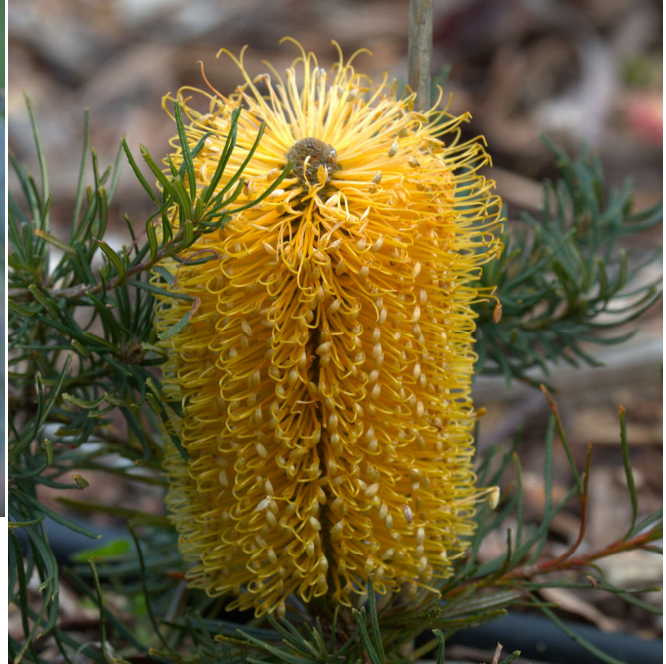
Banksia spinulosa 'Bold&Gold'