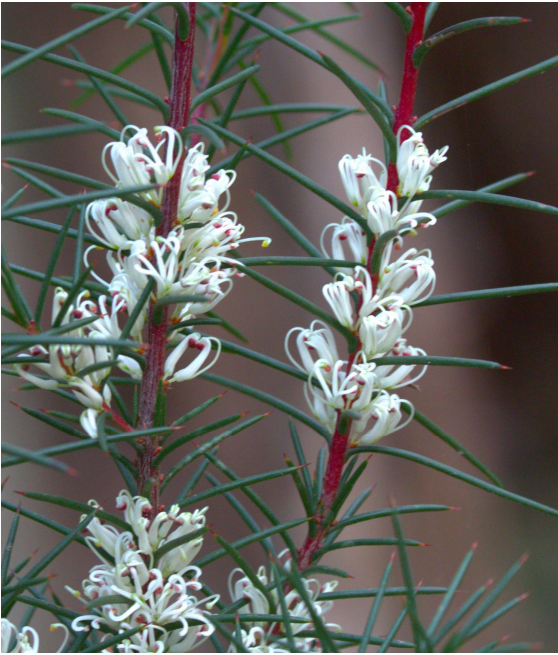
Hakea decurrens physocarpa

June – some Hakeas flowering in Bullengarook – (elevation 530 m)