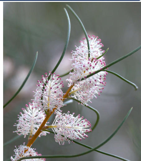
Hakea drupacea

Bring your own camera; and tripod if you have one.