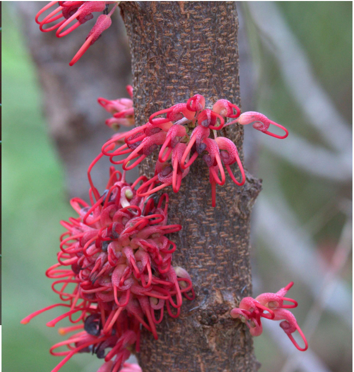
Hakea orthorrhyncha var filiformis