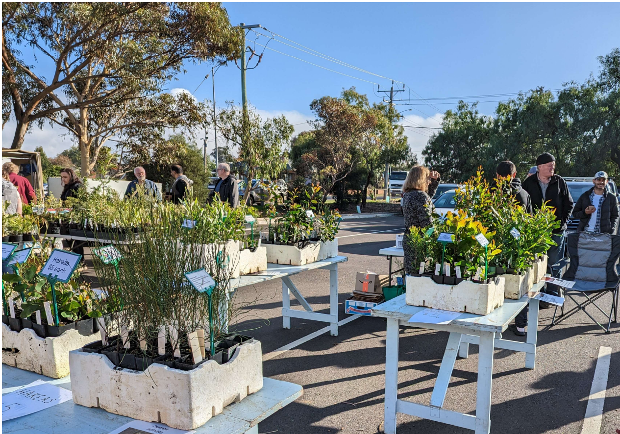
Our May plant sale was very successful, featuring - perfect weather.